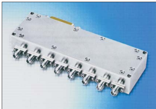
For SP8T applications from 1 to 18 GHz, MITEQ now offers the N828ANM2.